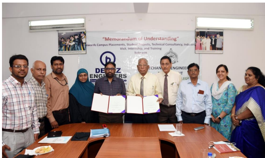
MoU Signing with Deraz Engineers