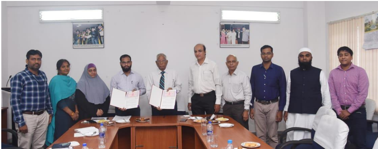
MoU Signing with HBL