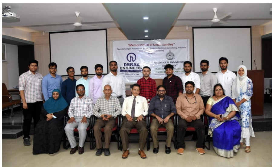
MED students got placement in Deraz engineers.