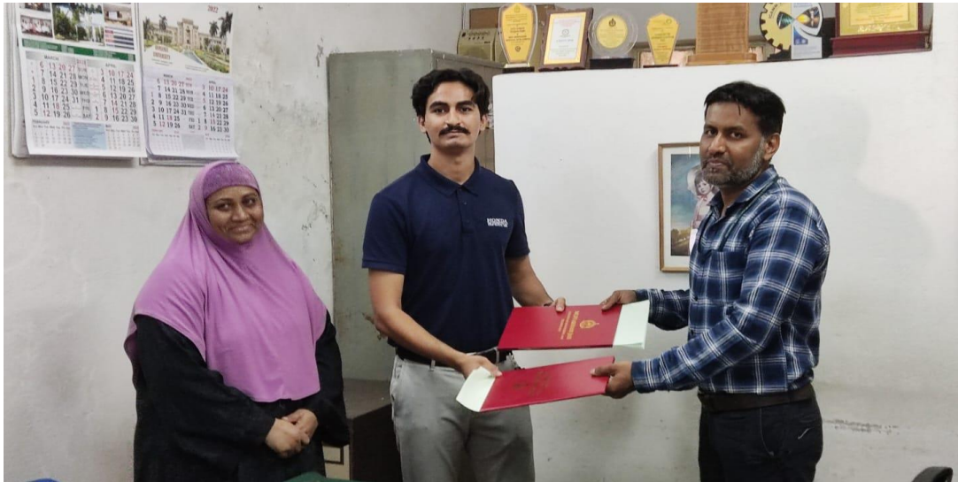
MoU Signing with Esmario Export Enterprises Pvt. Ltd.